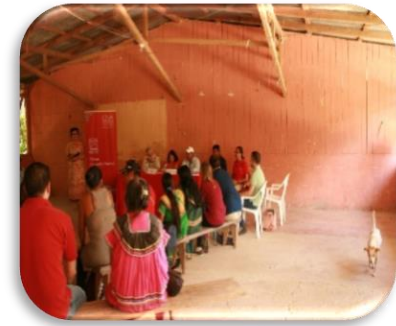
Community Center, Costa Rica