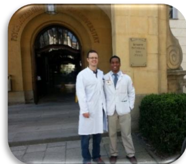
Bem Atim, USEU Germany

England: London: Kings College www.kcl.ac.uk/medicine . Additional information for applying to Kings College