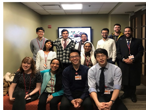
The February 2019 cohort of Visiting International Students