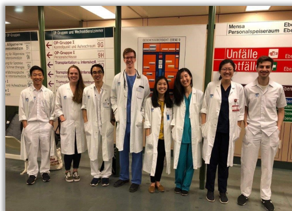
Weill Cornell Medicine Class of 2019 students during their elective in Vienna, Austria in the Spring

Happy Holidays from the Office of Global Health Education!